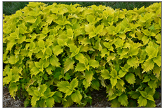
Wasabi Coleus