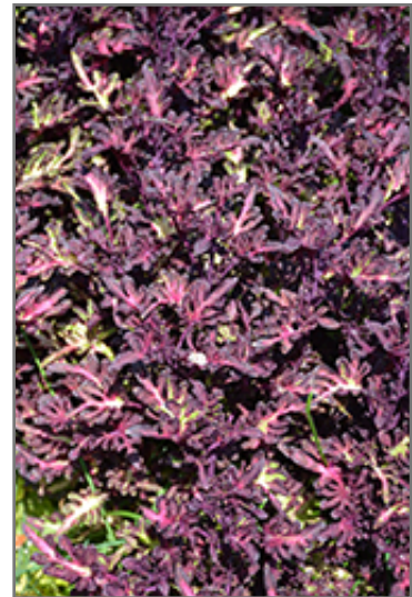
Merlin's Magic Coleus foliage