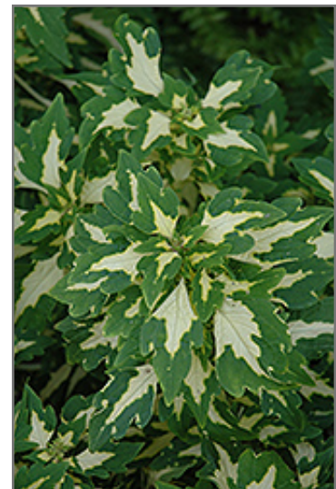
ColorBlaze Alligator Tears Coleus foliage