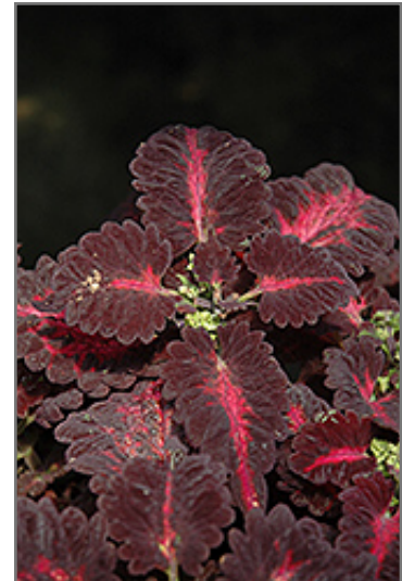
Black Dragon Coleus foliage