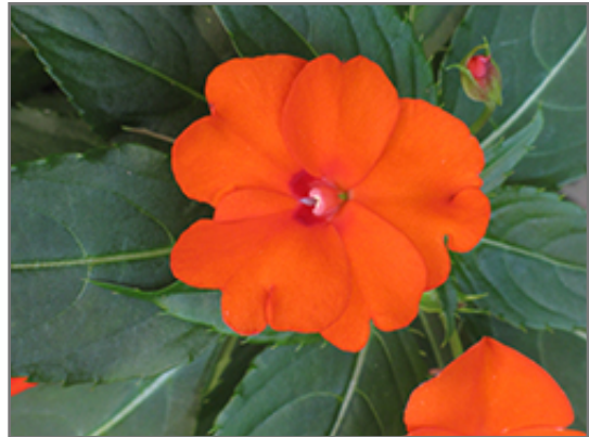
Infinity Orange New Guinea Impatiens flowers

Infinity Orange New Guinea Impatiens is a dense herbaceous annual with a mounded form. Its medium texture blends into the garden, but can always be balanced by a couple of finer or coarser plants for an effective composition.