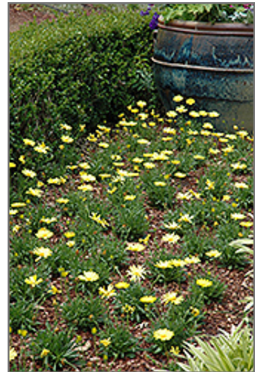
Voltage Yellow African Daisy flowers