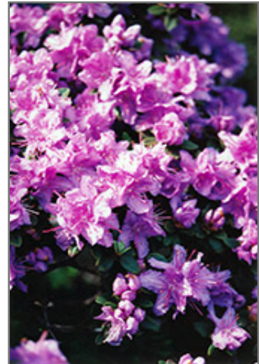
Ramapo Rhododendron flowers