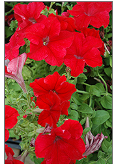
Dreams Red Petunia flowers