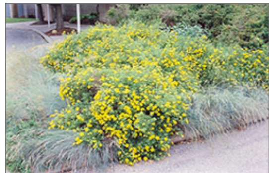
Goldfinger Potentilla in bloom