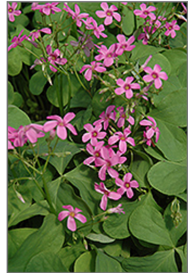
Pink Wood Sorrel flowers

Pink Wood Sorrel is recommended for the following landscape applications;