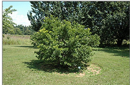
Jade Butterflies Ginkgo