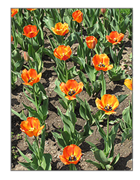
Blushing Apeldoorn Tulip flowers