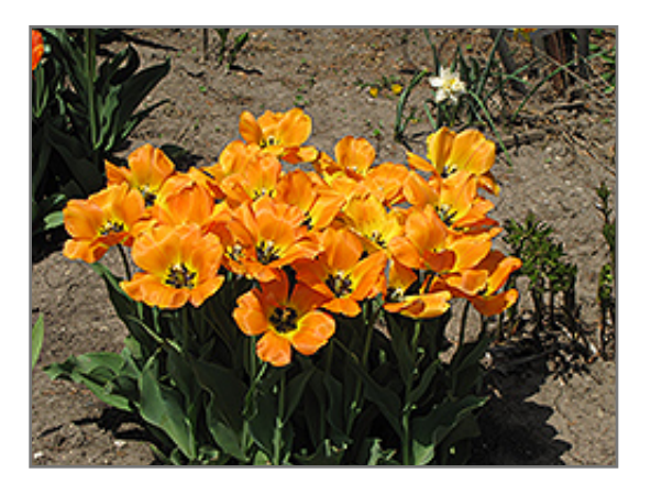
Blushing Apeldoorn Tulip flowers