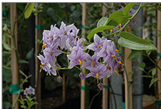
Glasnevin Chilean Potato Bush flowers

Glasnevin Chilean Potato Bush is recommended for the following landscape applications;