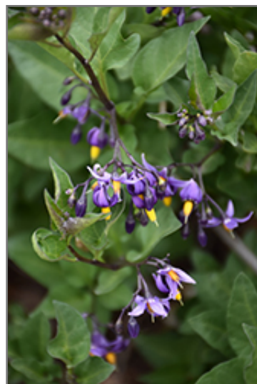
Glasnevin Chilean Potato Bush flowers

* This is a 'special order' plant - contact store for details