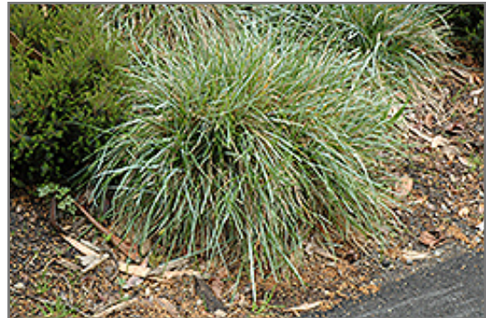
Blue Moor Grass