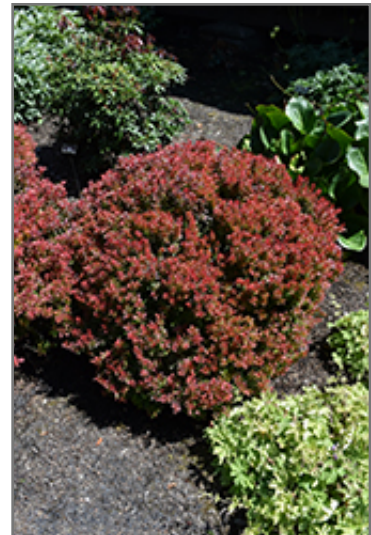
Golden Ruby Barberry